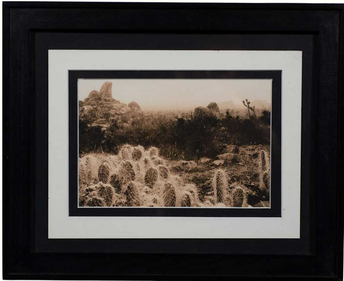
Benjamin Poarch "Rock and Hard Place" , 2020 Silver Gelatin, 8x10