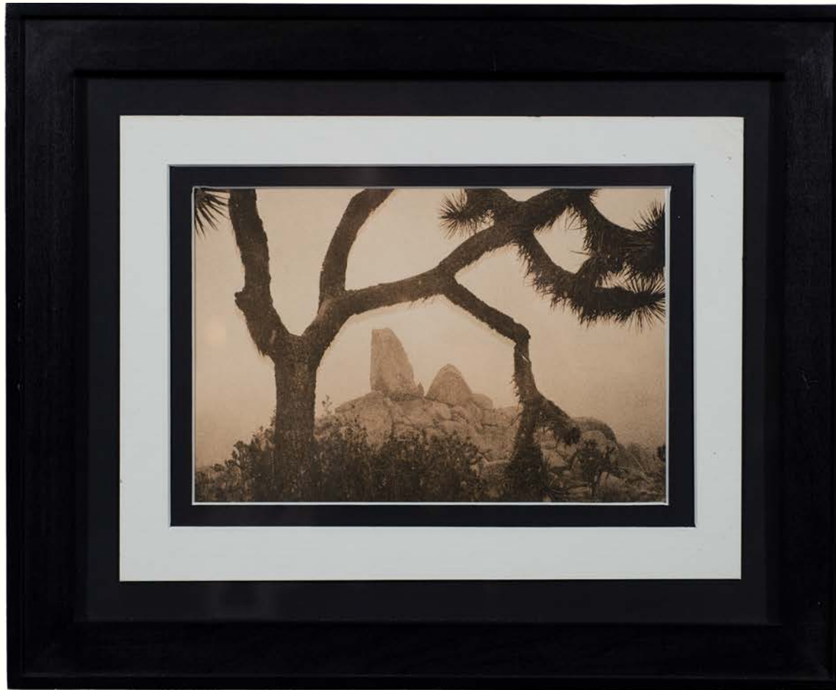
Benjamin Poarch "Stay Put" , 2020 Silver Gelatin, 8x10