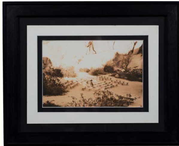
"Party of One"