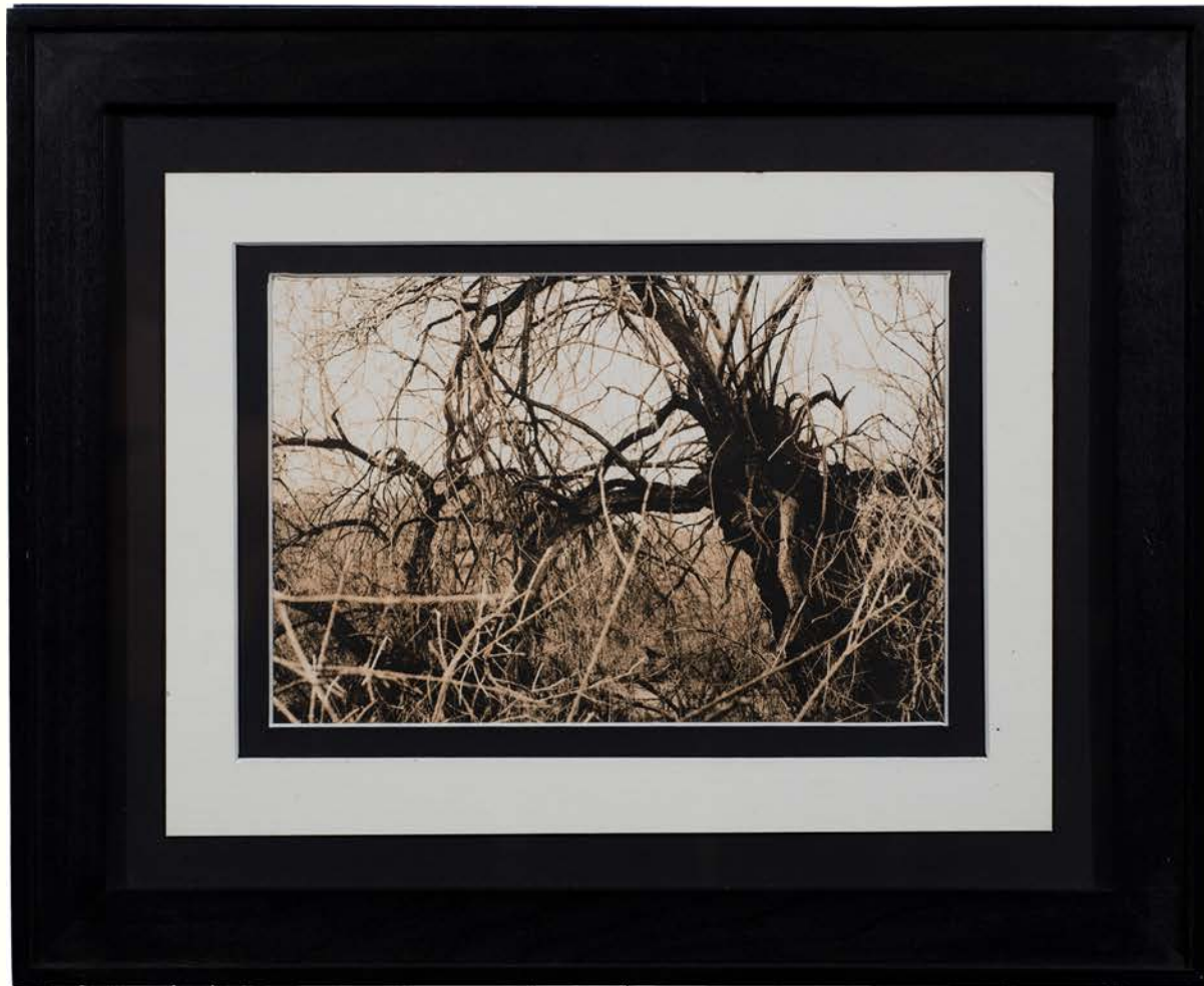
Benjamin Poarch "Fibrous" , 2020 Silver Gelatin, 8x10