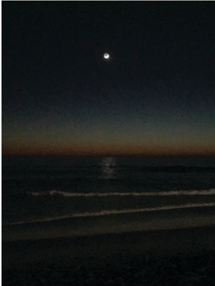
Maggie Skidmore "Waiting" , 2020 Photograph, 32 x 24"