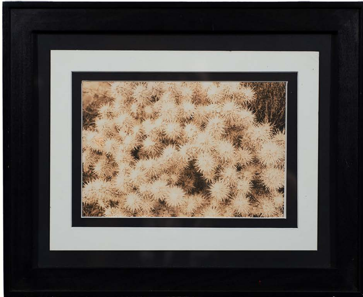
Benjamin Poarch "Crown of Thorns" , 2020 Silver Gelatin, 8x10