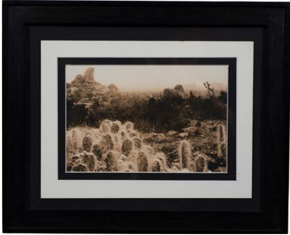
"Rock and Hard Place"