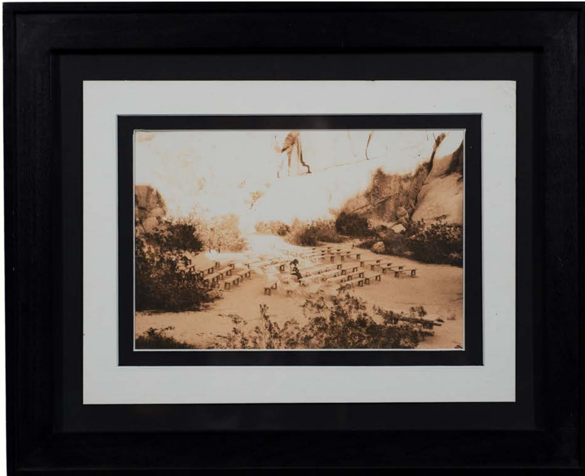
Benjamin Poarch "Party of One" , 2020 Silver Gelatin, 8x10