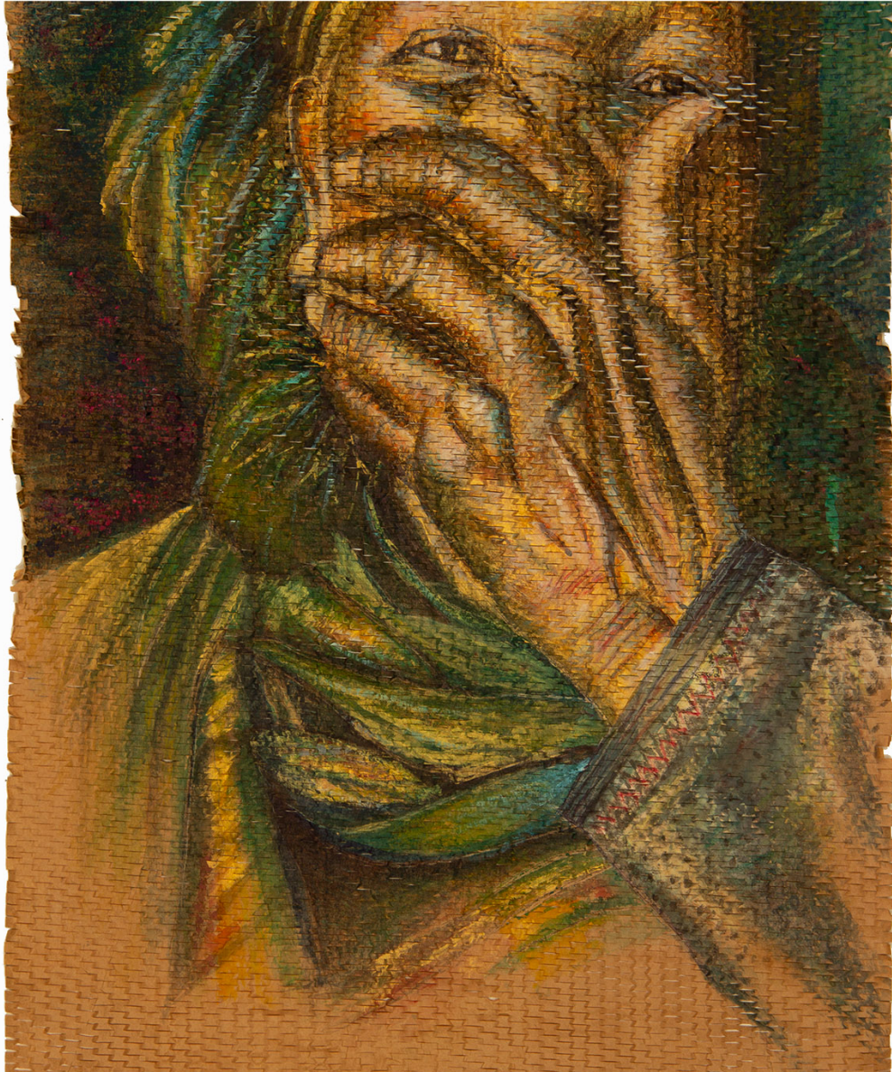
Neda Towfiq "The Immigrant" , 2020 Watercolor, 24 x 20"