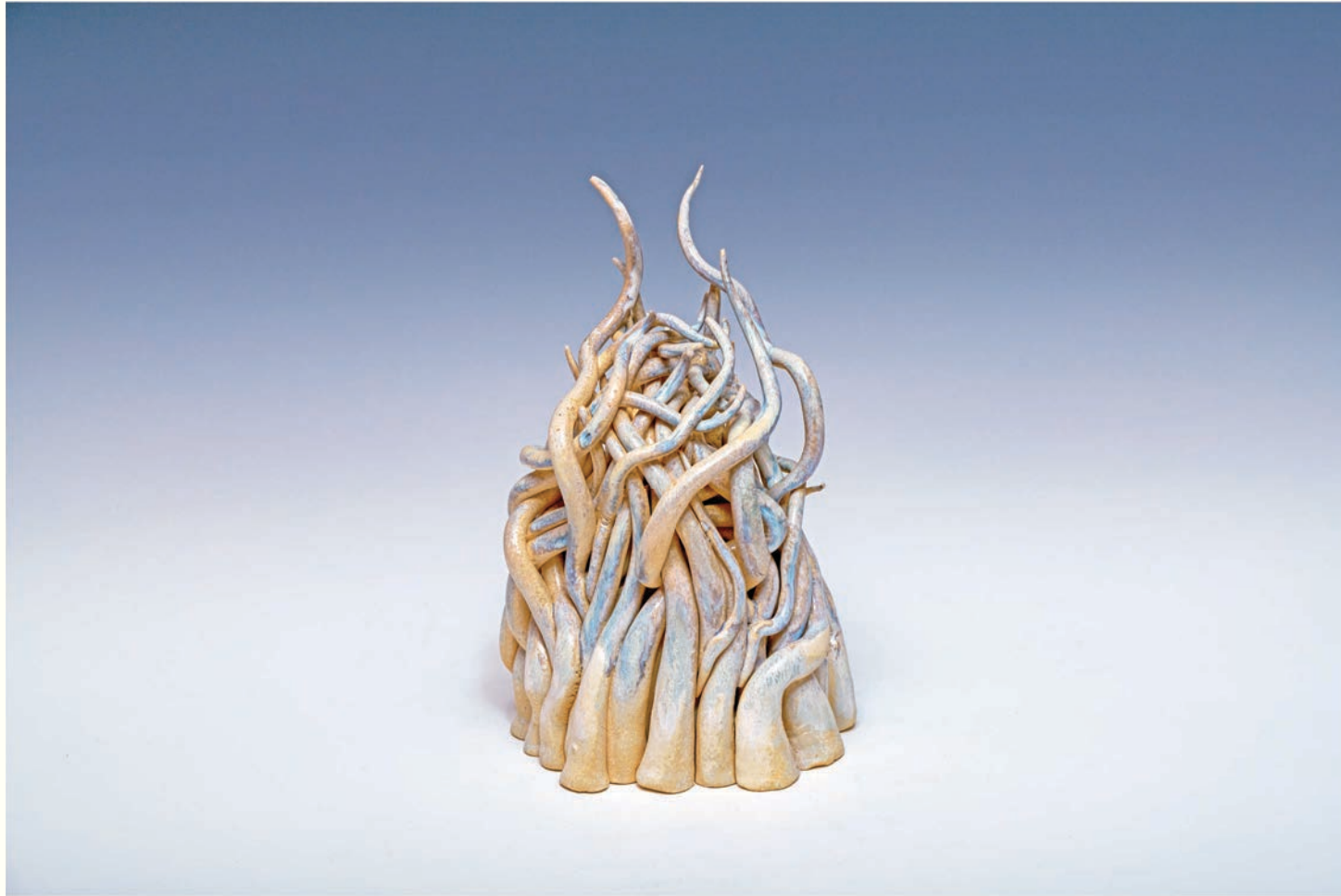
Stephanie Alacon "Just a Thought" , 2018 8.5 x 5.5 x 5"