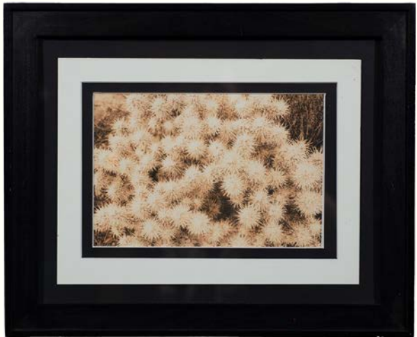
"Crown of Thorns"