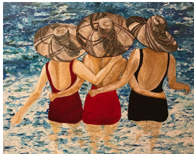
The Sisters , (Middle)