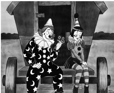
The Smile ,(Beginning)

Title about “Human Connection” , is exactly fitted and appropriate as a whole in every aspect and perspective of different artists' concepts that I put it into one meaningful composition, the Connections of human to human, human to object, and human to nature, as well as the universe. It's all about the cycle of life on how to live with relations and how to survive.