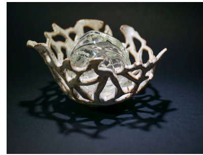
Released , (End)